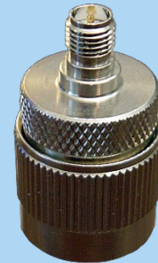
N Male to RPSMA Female