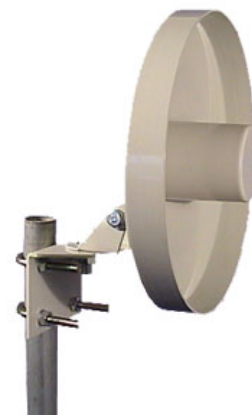
*Picture shown with standard pole mount bracket